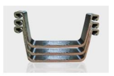
U CHANNEL STEEL