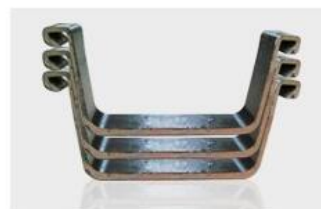
STEEL SHEET PILE